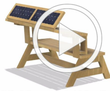
CS (Convertible Solar) Bench